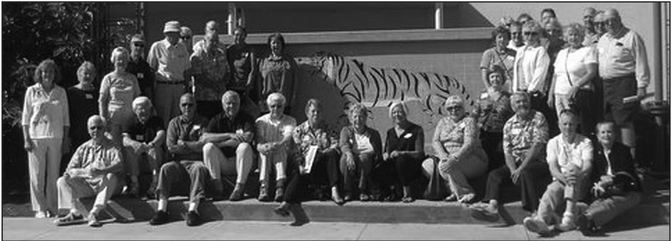
Classmates in front of 1957 Tiger Mural at the high school