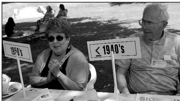
"Don't forget your name tag and lunch ticket"